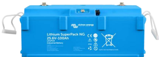
Lithium SuperPack 12,8/200 NG & 25,6/100 NG