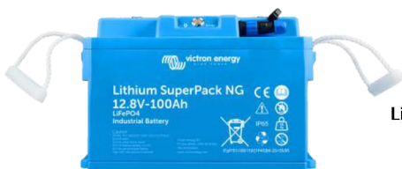
Lithium SuperPack 12,8/100 NG