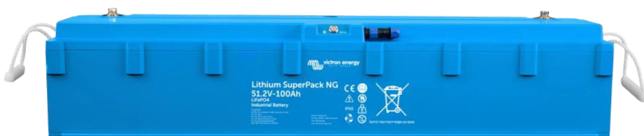
Lithium SuperPack 25,6/200 NG & 51,2/100 NG