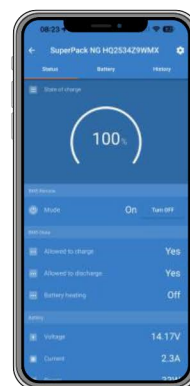
Live battery data displayed in VictronConnect