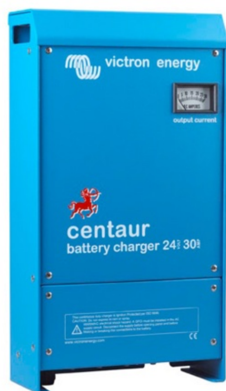
Centaur Battery Charger 24 30i